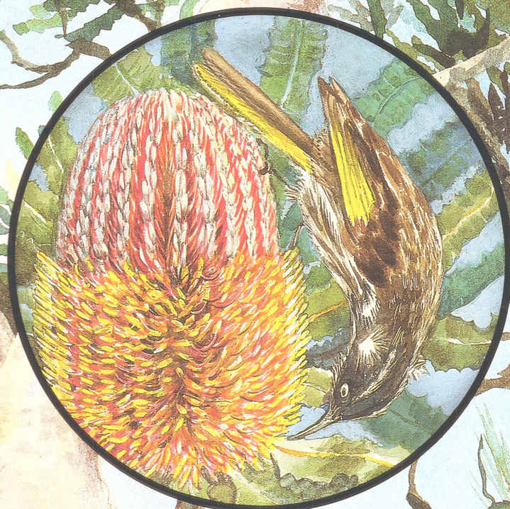
New Holland Honeyeater collecting nectar from the flowers of the Firewood Banksia.