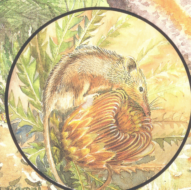
Honey Possum looking for nectar in Couch Honeypot flowers.