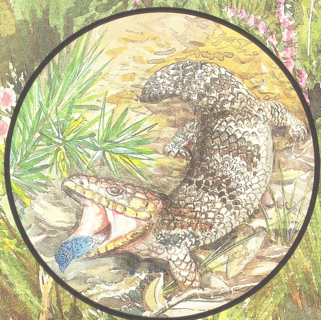
Bobtail warning off an intruder as it searches for a meal of Swan Berry fruit.