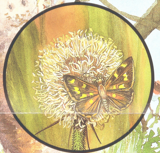
Western Three Spotted Skipper Butterfly sipping nectar from the flowers of a Pineapple Bush.