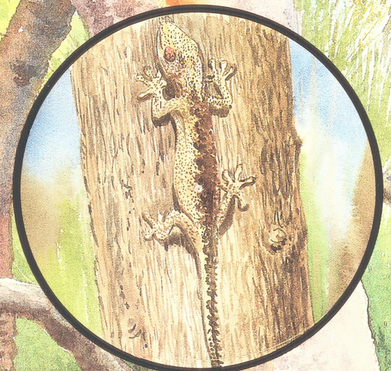
Western Spiny-tailed Gecko basking in the sun, camouflaged against the bark.