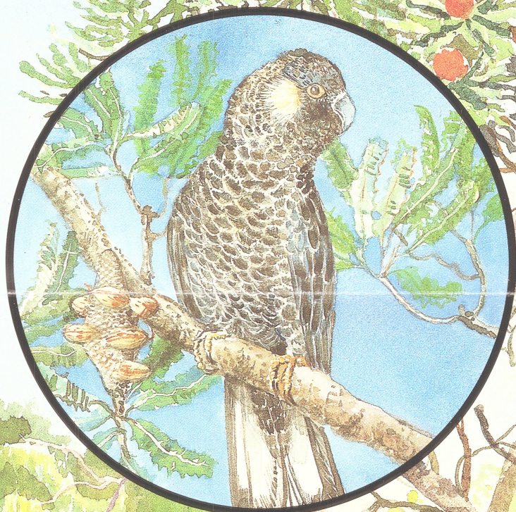
Black Cockatoo searching for seeds on a Firewood Banksia.