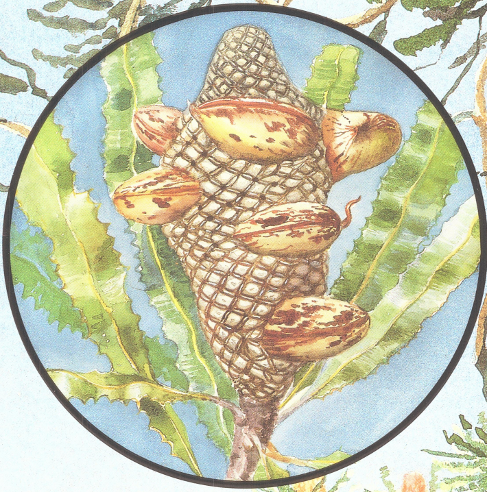
Firewood Banksia cone before the seeds are released.

Banksia Woodland is a unique plant community found on the sandy soils of the coastal plain around Perth. A special community of plants and animals live in the Woodland. The plants and animals in Banksia Woodland depend upon each other for their survival. Banksia Woodland is susceptible to Dieback.