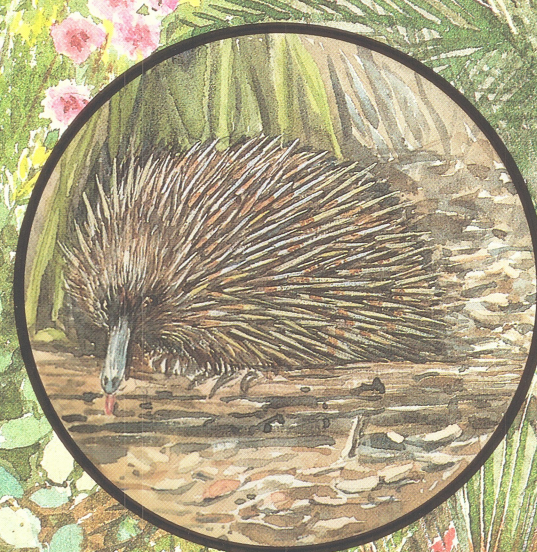
Echidna searching for termites.